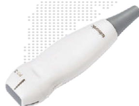
Phased P7-3 Small to medium animals heart