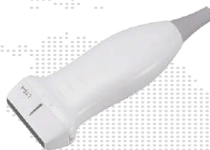
Linear L15-4 MSK of medium to large animals Small animals whole body