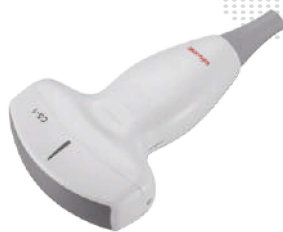
Convex C5-1 Medium to large animals Abdomen, reproductive system