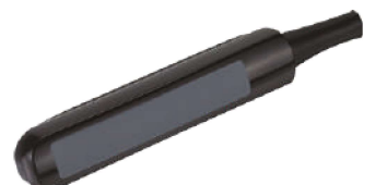
Linear L9-4V Intracavity, reproductive system