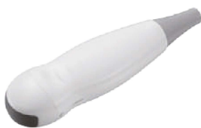
Micro-Convex C8-3 Small animals abdomen and heart